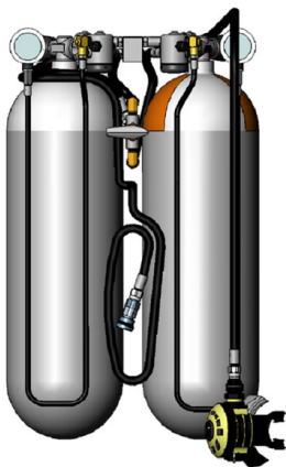
XBS ASSEMBLY (Plastic case is hidden)